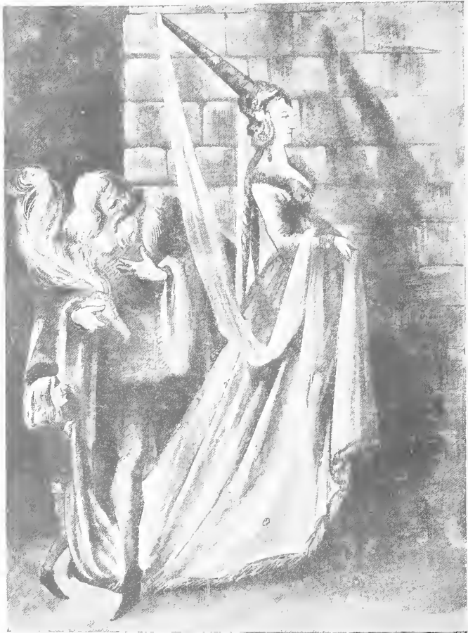
The modest and virtuous Lady D'Hocquetonville.